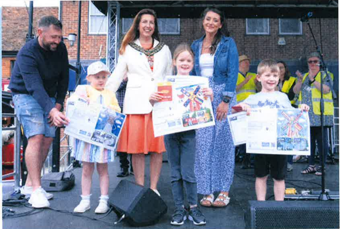
The BTMK Colouring Competition winners at the Trinity Fair.

The Mill Arts and Events Centre, Holy Trinity Church, Rayleigh Town Museum, Windmill, WI Hall, Royal British Legion Club, Rayleigh Mount and Pink Toothbrush were all open during the day and welcomed visitors.